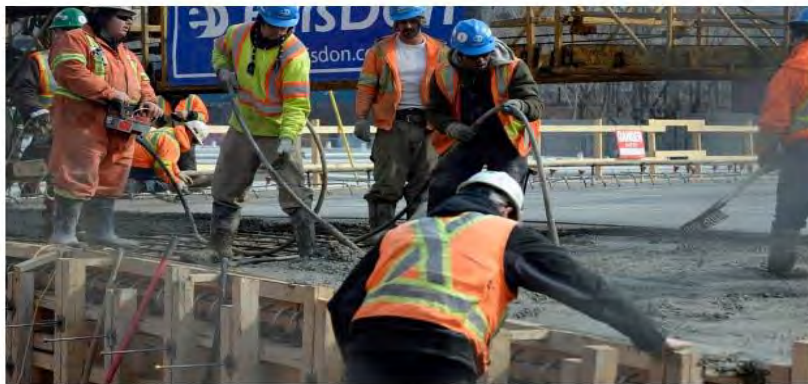
Construction noise is among the top causes of noise pollution in Toronto, city officials say.

CBC News Posted: Jun 23, 2015 9:57 PM ET | Last Updated: Jun 23, 2015 9:57 PM ET