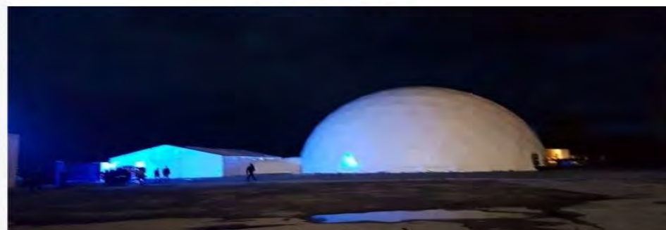
Toronto police received multiple noise complaints pertaining to an "exclusive industry" party in a white dome Tuesday, May 30 near Cherry and Commissioners streets.