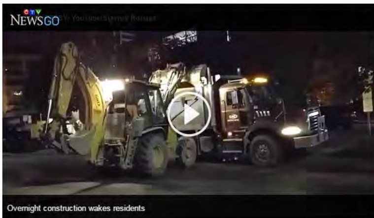
Overnight construction wakes residents